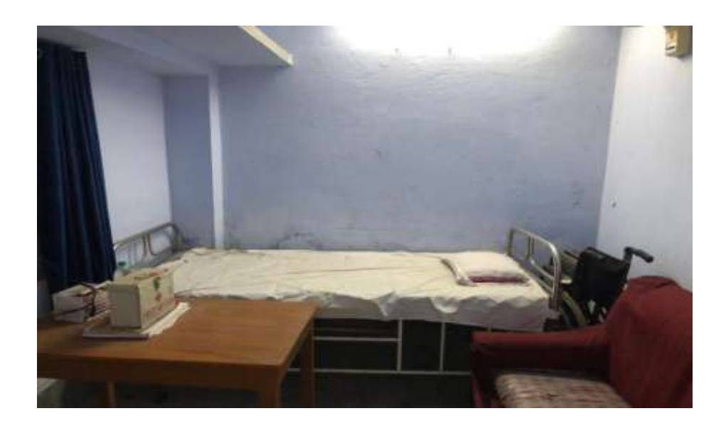
Environmental Management Program:

j. One medical unit and one skill development centre is available.