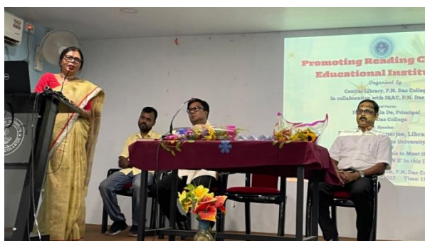
Welcome Address by Principal