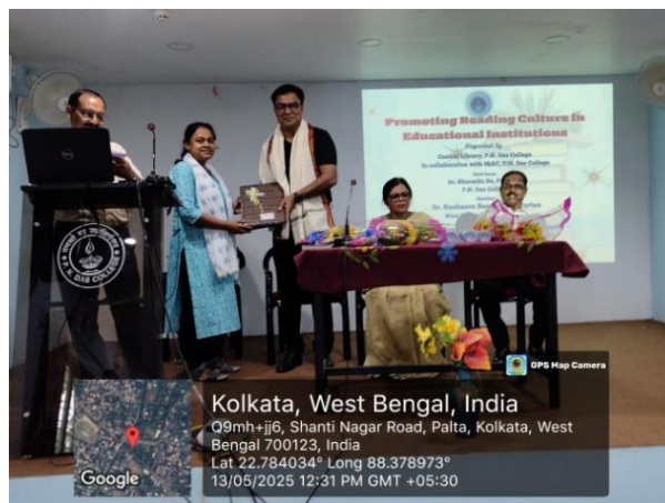
Felicitation of Guests