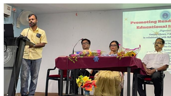
Brief speech by IQAC Coordinator